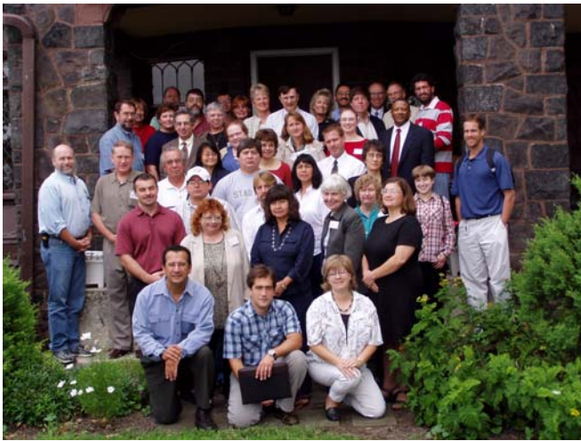
Participants in the Pennsylvania Intertribal Summit held in Harrisburg last September.

A final report on the Intertribal Summit has been completed and will be mailed out to each of the tribes soon. A copy of the report will also be posted on the web at: www.penndotcrm.org .